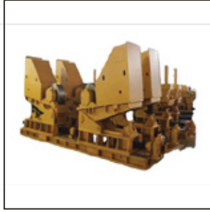
100-1200T ANTI CREEP WELDING ROTATOR