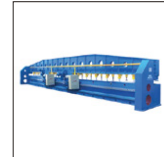
EDGE MILLING MACHINE

📍 Location Office 2607 Zhaoyin Mansion, 36, Hongkong Middle Road, Qingdao 266071, China.