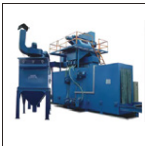
H BEAM SHOT BLASTING MACHINE