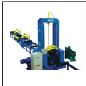
H BEAM ASSEMBLING MACHINE