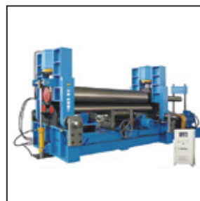
MULTI-FUNCTION 3-ROLLER PLATE BENDING MACHINE