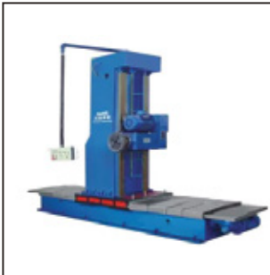
END FACE MILLING MACHINE