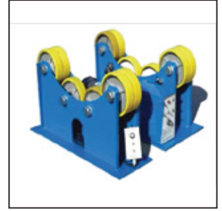
1000KG WELDING ROTATOR