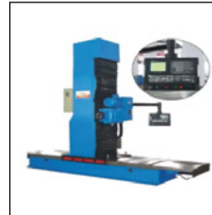
CNC END FACE MILLING MACHINE