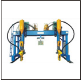
H BEAM WELDING MACHINE