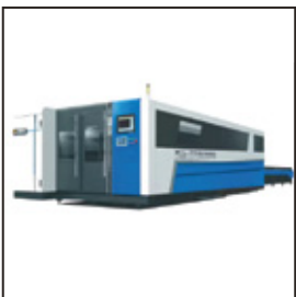
ZXL-FPED FIBER LASER CUTTING MACHINE