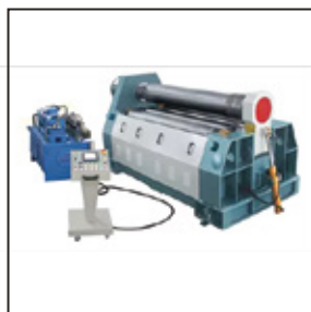
FOUR ROLLER PLATE BENDING MACHINE