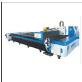
ZXL-FCP FIBER LASER PIPE AND PLATE CUTTING MACHINE