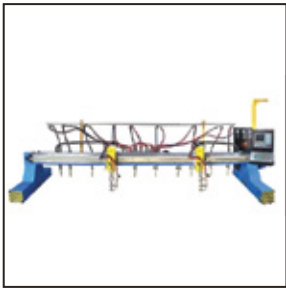
CNC FLAME CUTTING MACHINE