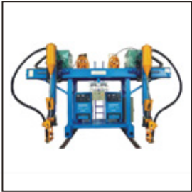
CANTILEVER TYPE H BEAM AUTO-WELDING MACHINE