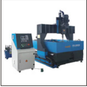
CNC PLATE DRILLING MACHINE