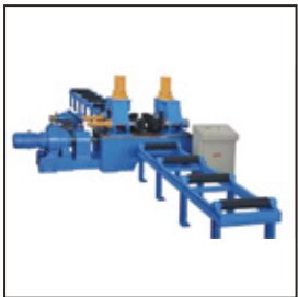
H BEAM HYDRAULIC STRAIGHTENING MACHINE