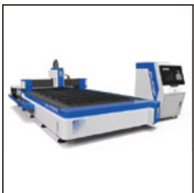
ZXL-FC FIBER LASER CUTTING MACHINE