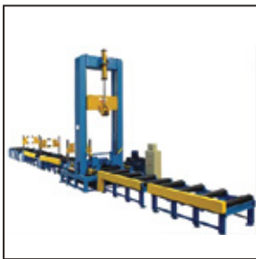
HEAVY H BEAM ASSEMBLING MACHINE