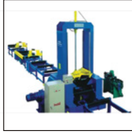
H BEAM ASSEMBLING MACHINE