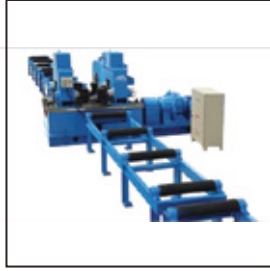
H BEAM FLANGE STRAIGHTENING MACHINE