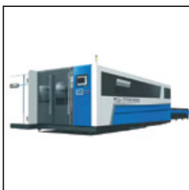
ZXL-FPED FIBER LASER CUTTING MACHINE