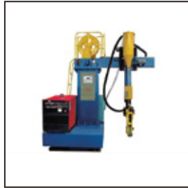
CANTILEVER WELDING MACHINE