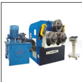
PROFILE BENDING MACHINE