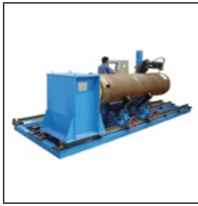
CNC PIPE CUTTING MACHINE