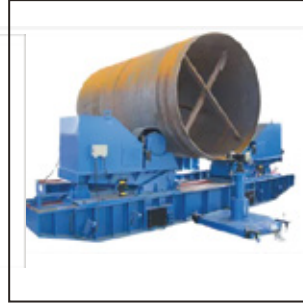
160T 300T 400T ANTI CREEP WELDING ROTATOR