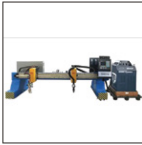
CNC PLASMA CUTTING MACHINE