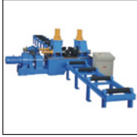
H BEAM HYDRAULIC STRAIGHTENING MACHINE